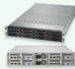
AS -2014TP-HTR 2U System with 4 hot-pluggable Single-Processor Server Nodes