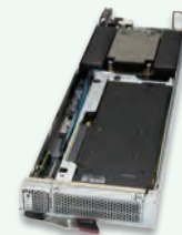
SBA-4119SG GPU Model with 2 GPUs, M.2 NVMe