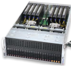
4U 8-GPU with PCI-E