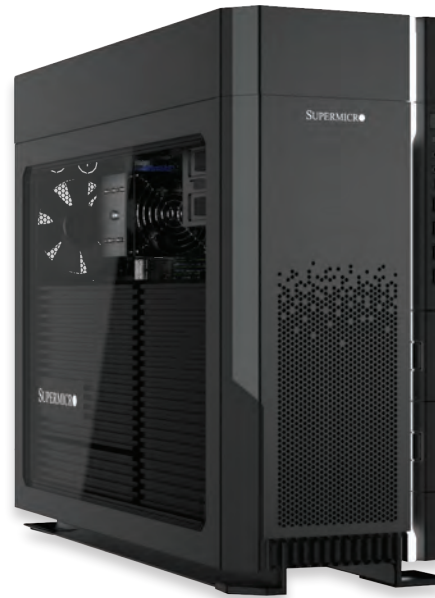
SuperWorkstation 5U Rackmountable/Tower AS-5014A-TT

A rich selection of storage options, AOCs, CPU TDP and memory speed support