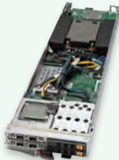
SBA-4114S-T2N SATA/NVMe Model (AOM module)

Up to 20 Single Processor Nodes in 8U with 8 DIMMs and mezzanine card for advanced networking