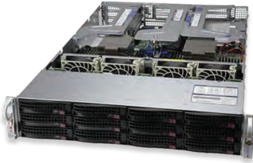
2U Ultra, 8TB DDR4