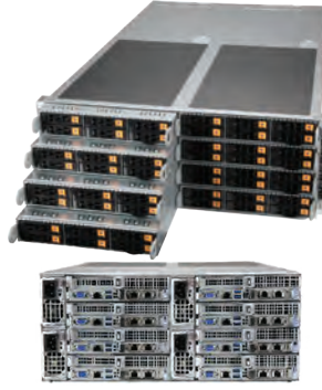
8 Nodes, Rear IO