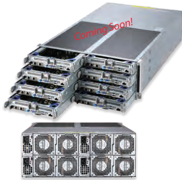
8 Nodes, Front I/O