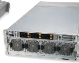
4U 8-GPU with HGX