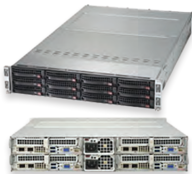
TwinPro® - 2U 4 UP Nodes