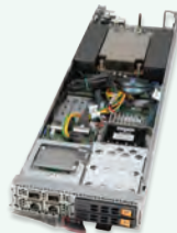
SBA-4114S-C2N SAS/SATA/NVMe Model (AOM module)