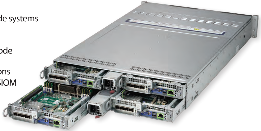
A+ BigTwin® (2U4N)

Flexible storage and I/O options including NVMe/SATA3 and SIOM networking