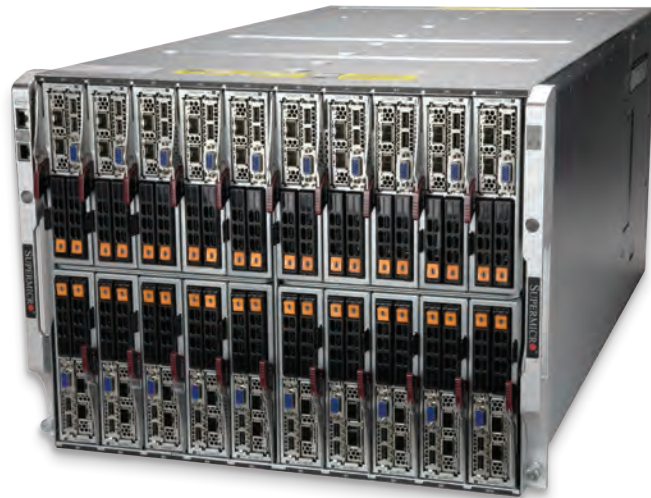
SBE-820C/H/L/J (Front View)

Integrated HPC network fabrics for up to 200G HDR InfiniBand with 100% non-blocking switch