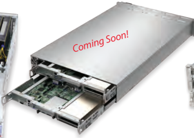
2U 2-Node, 4-GPU with PCI-E