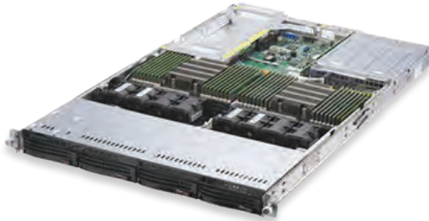
1U Ultra, 8TB DDR4