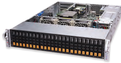
2U UP WIO