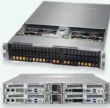
AS -2124BT-HNTR 2U System with 4 hot-pluggable Dual-Processor Server Nodes with U.2 NVMe